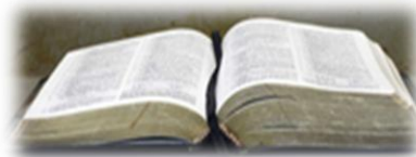
The Holy Bible (Original King James Version)

The knowledge of God's word that I am writing about is the last gospel. It is the last information that the people of the earth will receive from God concerning salvation. The next communication that the earth receives from God will be the judgment of God to the unsaved. This present time that God is allowing the people of the earth to hear the gospel is known as the "grace age". This means that God is granting favor to the people of the earth that they might be saved.